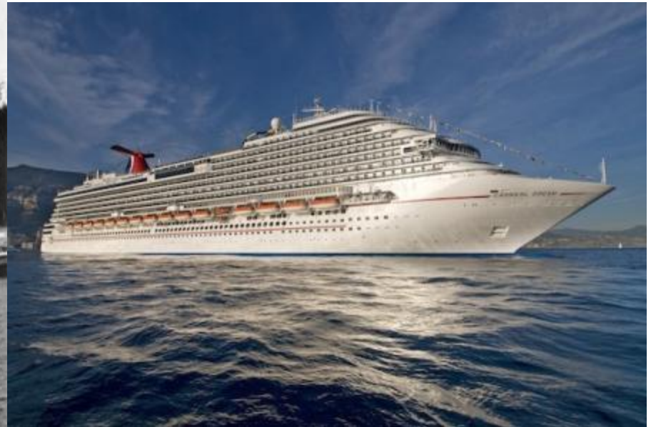
Carnival Dream : Year built 2009